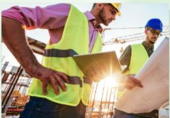
Be Work Ready